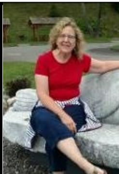
Lion Laurie High