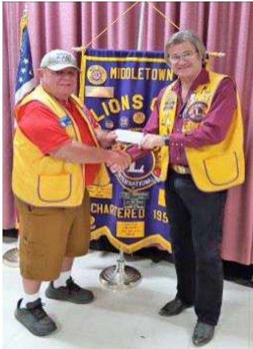
FOOTHILL LIONS CLUB AT THE MIDDLETOWN LIONS CLUB WITH DONATION FOR FIRE VICTIMS. (Please see page 2 for article)