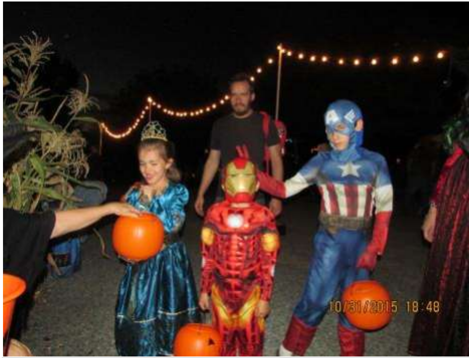
TRICK OR TREAT STREET—HALLOWEEN COMMUNITY EVENT