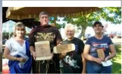
Fun Fun Day all around.