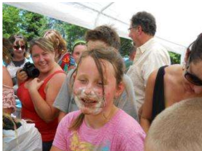
PIE EATING CONTEST – YUM YUM - GOOD