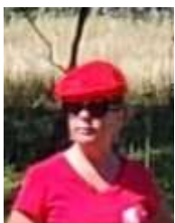
Club Service Chair